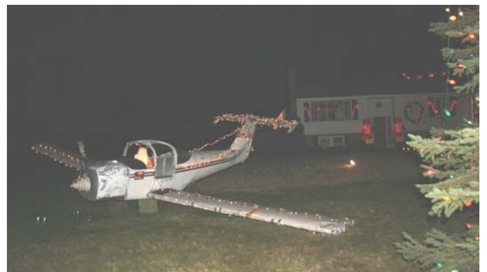
LOOK WHAT'S IN MY FRONT YARD