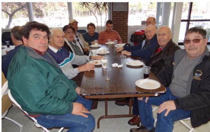
This is just one of the tables at Manadnock Aviation full of pilots from SFZ. Notice their full bellies...