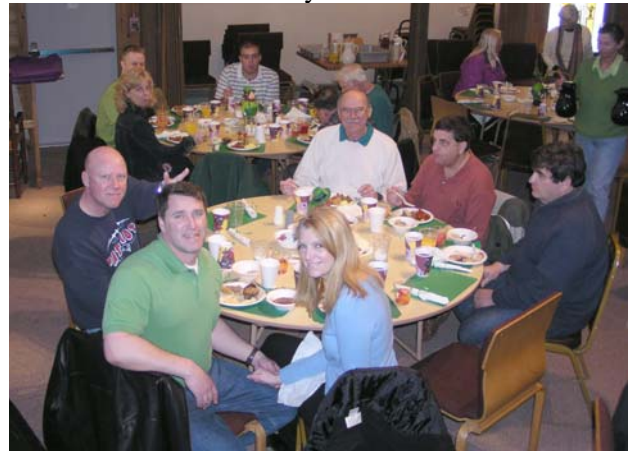
Here are just a few of the RIPA members that attended the St. Patrick's Day Brunch on Block Island