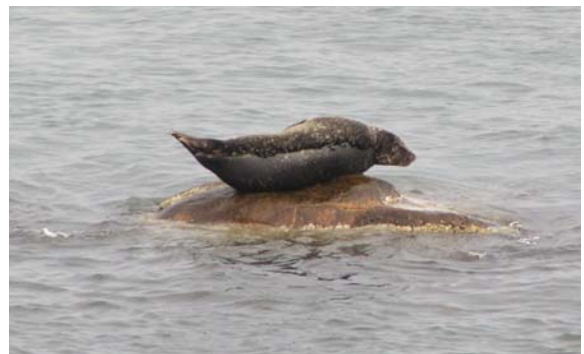
Seal Rock near St. Andrew's Parish Hall