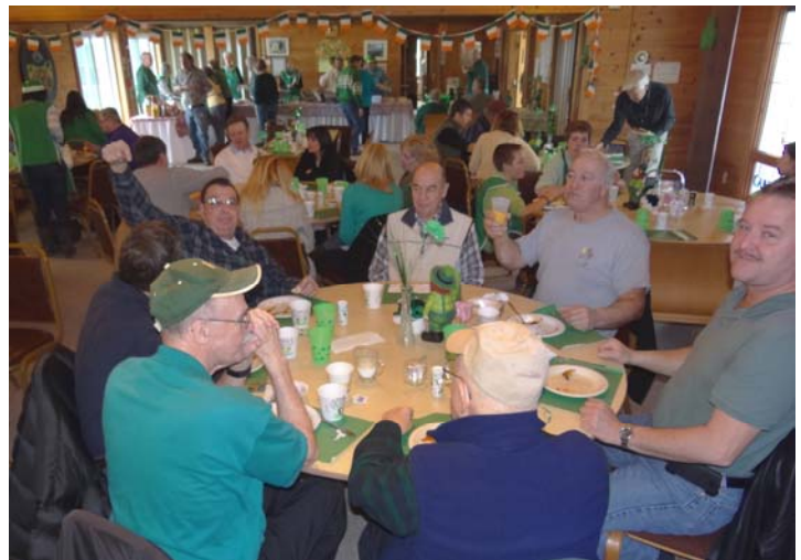
Nice weather brings a full house at the St. Patrick's Day Brunch on Block Island.