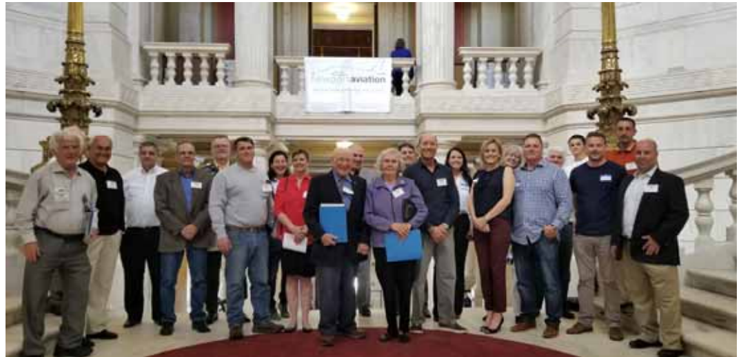
Members of Rhode Island Pilots Association and the Rhode Island General Aviation Business Owners Association in the Statehouse Rotunda 26th April 2018 for RI Aviation Lobby Day!