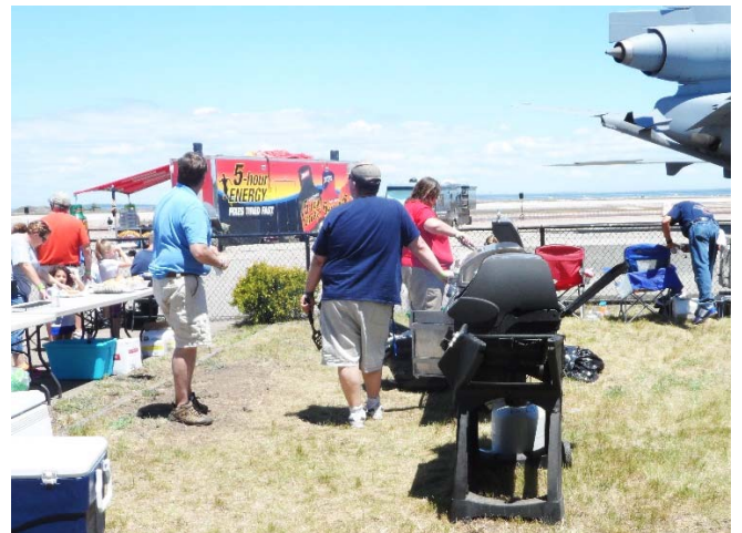
Even the cooks had to check out the action.