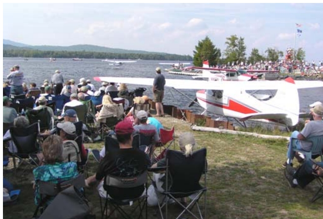
The crowd at the sea plane base.