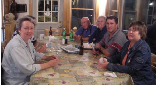
Members meet at Rene's place.