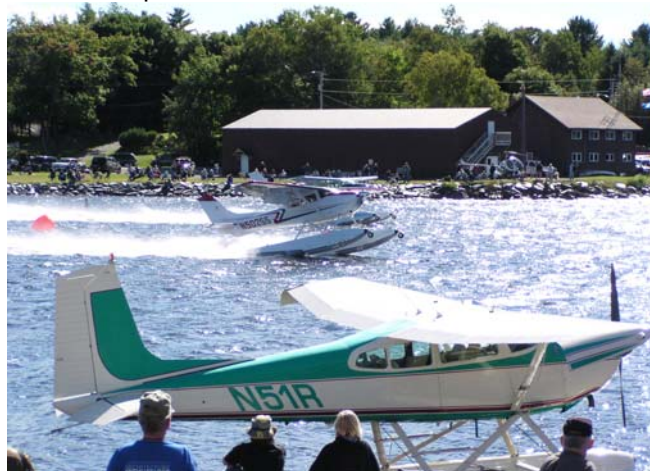
These are two float planes competing in the shortest take off event.