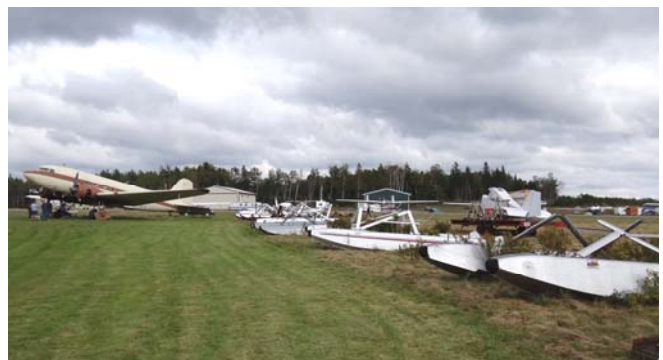
Angry sky at 3B1 and a line of floats without their planes. There have been better days.