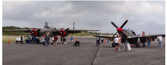
North American B-25 Mitchell North American TP-51C Mustang