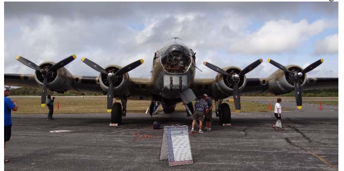
Boeing B-17G Flying Fortress