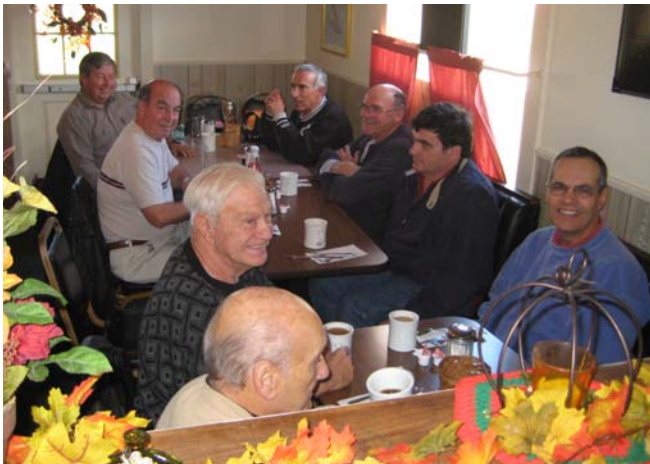
Here's the gang waiting for their food to arrive at Campy's Country Kettle.