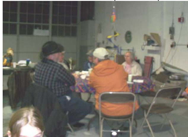
Some members gathered around tables