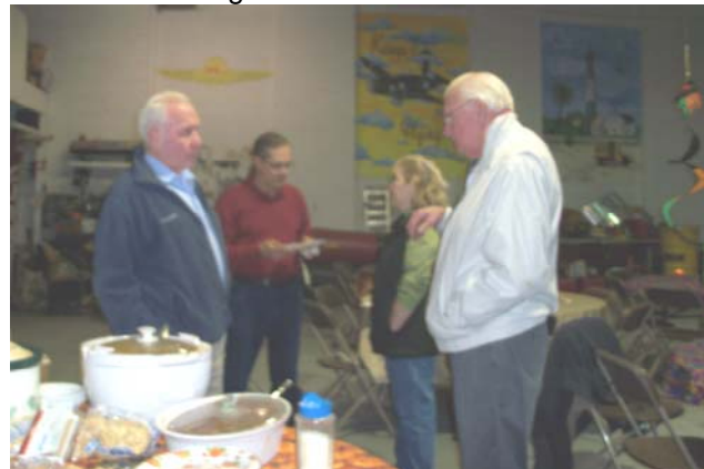
And some gathered around the food